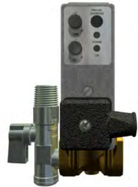
Adjustable Timed Electric Drain for HGEN Models 75 - 150 scfm