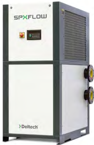
Model Shown: HGEN1200