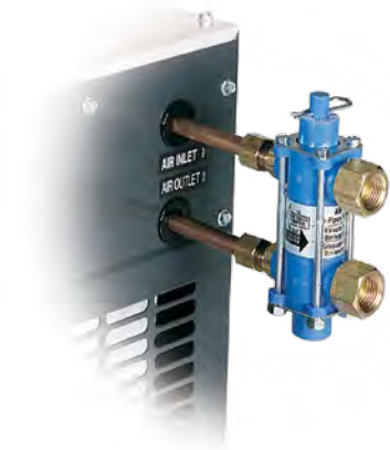
Air Bypass Valve