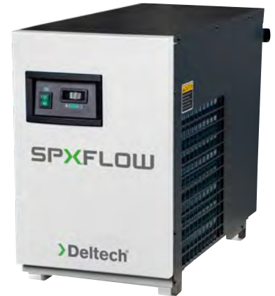
Model Shown: HGEN75