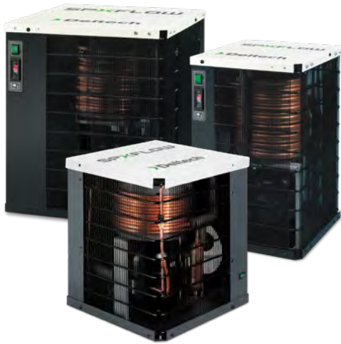
Efficient Smooth Copper Heat Exchangers

Customers around the world have relied on Deltech for great value in air treatment solutions. Deltech Refrigerated Dryers offer a simple solution based on a long history of industry leading technology.