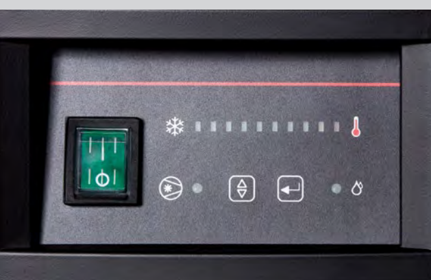
Controls: Models 200-1200 scfm