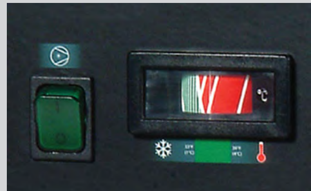
Controls: Models 75 - 150 scfm